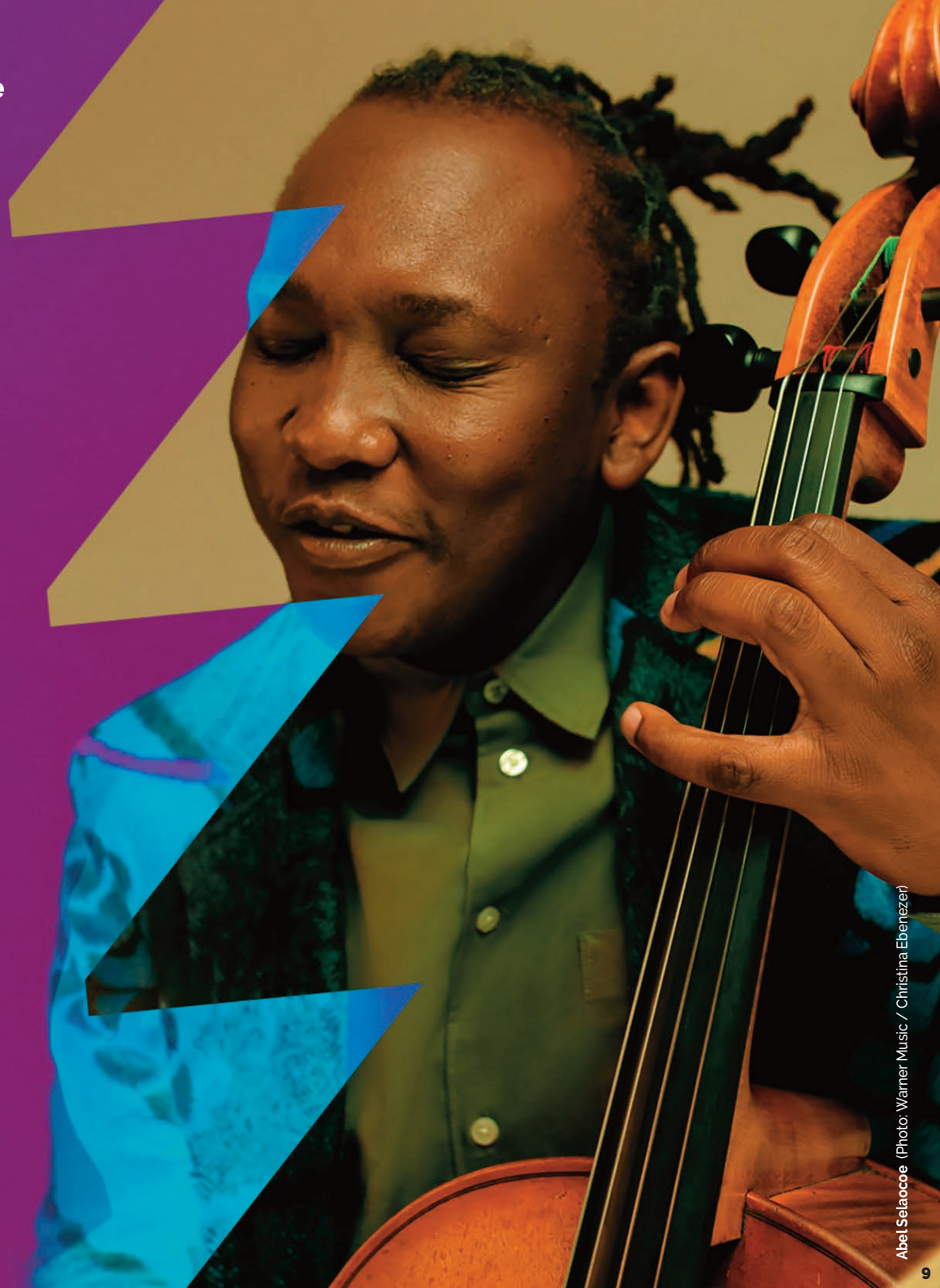
Abel Selaocoe